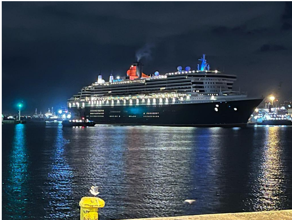
The Queen Mary 2 docked in the Port of Cape Town