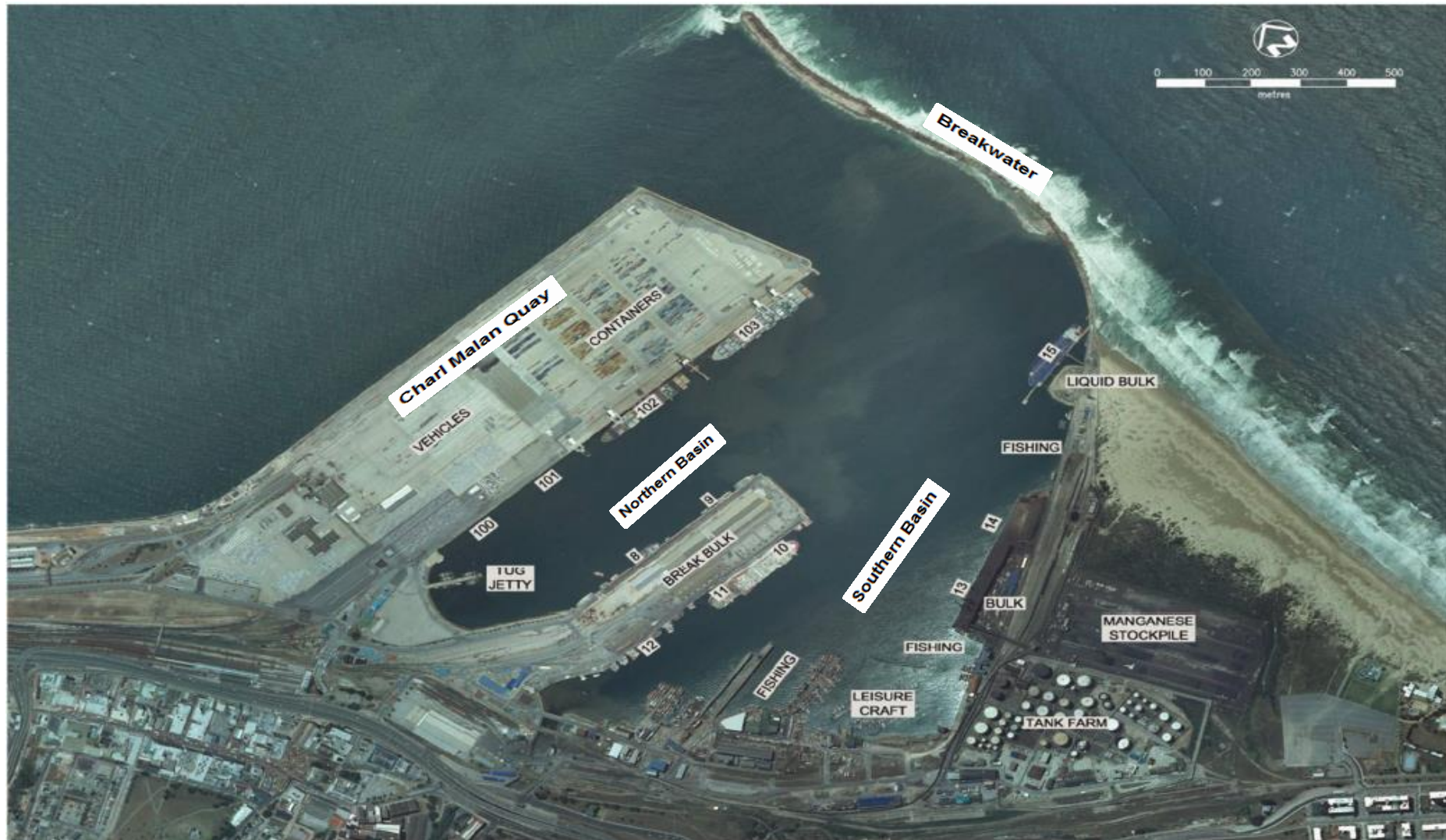
Figure 1: Locality Map of the Port of Port Elizabeth